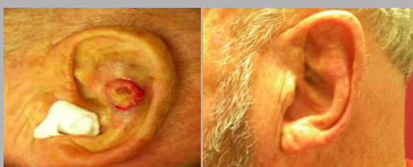
SKIN CANCER AFTER OPERATION