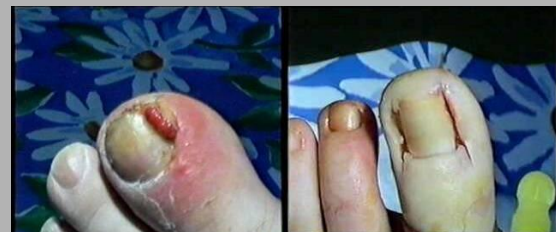
INGROWN TOE NAIL AFTER OPERATION