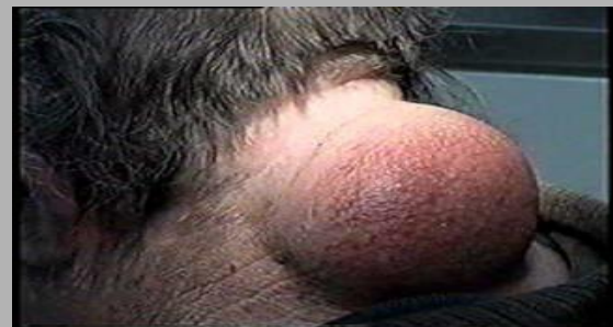
LIPOMA - NECK BEFORE OPERATION