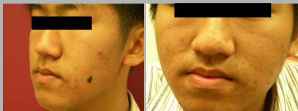
MOLE ON FACE AFTER OPERATION

All these procedures are performed under Local Anaesthesia & patients usually do not require time off work.