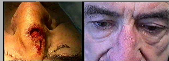
BCC NOSE DURING & AFTER OPERATION

When patients put faith in me to look after them, I put my heart & soul in the work I do & use my surgical skills of 30 years to give the best results.