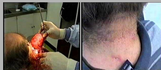
DURING & FEW WEEKS AFTER OPERATION